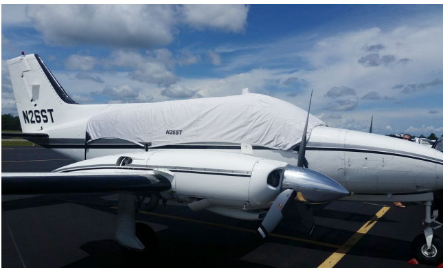
Cessna 414 Canopy Cover

This cover type is made from Silver Acrylic Sunbrella canvas and is 100% lined with a soft and smooth microfiber. Bruce's Custom Covers developed this material combination especially for aircraft protection. The outer material is medium weight and treated for water resistance, UV resistance and anti-static buildup. The inner lining is a very soft and smooth microfiber to prevent scratching. The material is very reflective, and tests show that the cabin interior temperature can be reduced to near-ambient temperature on the hottest of days. It is water, ice and snow repellent, yet breathable to allow moisture to escape from between the cover and the aircraft surface.