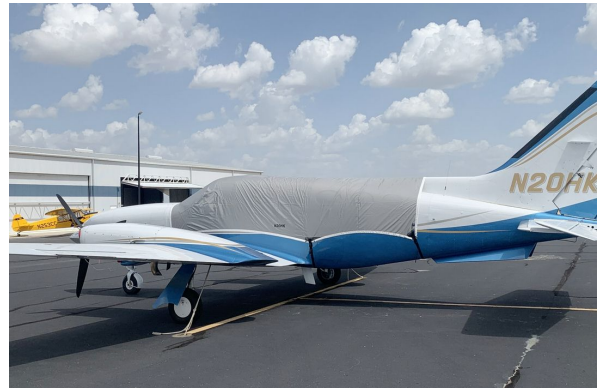
Cessna 414 Travel Weight Canopy Cover