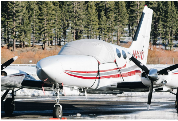
Cessna 414 Cockpit Cover