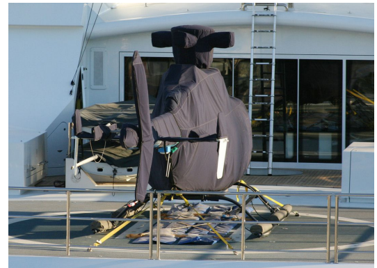
Bell 407 Complete Cover Set