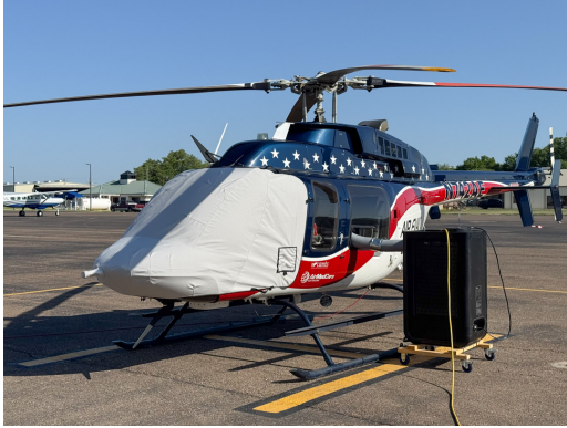
Bell 407 Abbreviated Bubble Cover, secures to front doors.

This cover type is made from Silver Acrylic Sunbrella canvas and is 100% lined with a soft and smooth microfiber. Bruce's Custom Covers developed this material combination especially for aircraft protection. The outer material is medium weight and treated for water resistance, UV resistance and anti-static buildup. The inner lining is a very soft and smooth microfiber to prevent scratching. The material is very reflective, and tests show that the cabin interior temperature can be reduced to near-ambient temperature on the hottest of days. It is water, ice and snow repellent, yet breathable to allow moisture to escape from between the cover and the aircraft surface.