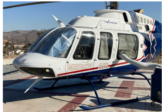
Bell 407 Windshield HeatShields