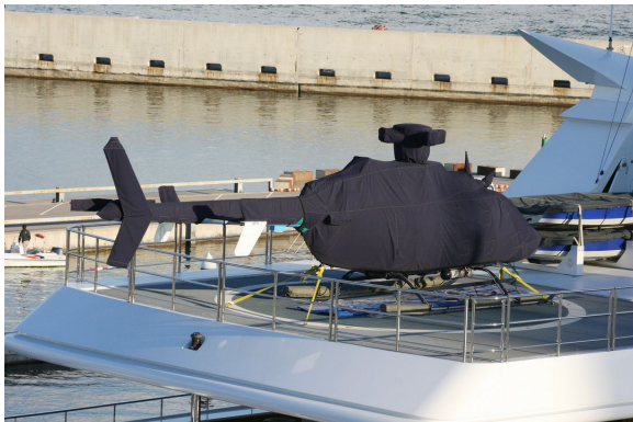
Bell 407 Complete Cover Set

The Tailboom Cover details vary by model, but generally the helicopter tail boom cover encloses the tail boom from the "bottleneck" to the aft end. They usually also cover the horizontal stabilizers, and are custom made to allow for antennae, lights, and other protrusions. They attach with straps underneath the tail boom. Covers for the vertical and horizontal stabilizers are also available separately. Specific information for each model is available on request.