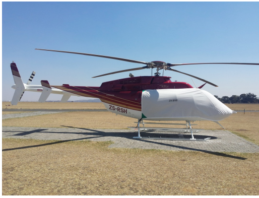
Bell 407 Bubble Cover with Wire Strike