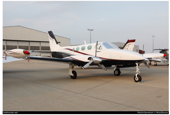
Cessna 340 Wingtip Pads