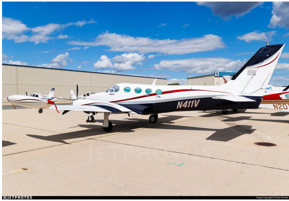
Cessna 340 Wingtip Pads