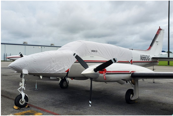
Cessna 340A Canopy/Nose Cover

This cover type is made from Silver Acrylic Sunbrella canvas and is 100% lined with a soft and smooth microfiber. Bruce's Custom Covers developed this material combination especially for aircraft protection. The outer material is medium weight and treated for water resistance, UV resistance and anti-static buildup. The inner lining is a very soft and smooth microfiber to prevent scratching. The material is very reflective, and tests show that the cabin interior temperature can be reduced to near-ambient temperature on the hottest of days. It is water, ice and snow repellent, yet breathable to allow moisture to escape from between the cover and the aircraft surface.