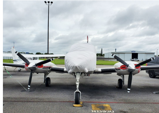
Cessna 340A Engine Inlet Plugs