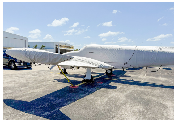
Cessna 340 Complete Cover Set