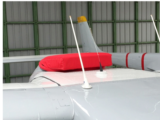
Cessna 337 Skymaster Aft Engine Inlet Cover, hoop type