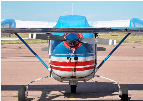
Cessna 337 Skymaster Aft Engine Inlet Plugs

Engine Inlet Plugs are custom fit for your Cessna 336 (Fixed Gear Skymaster) intakes, made with heavy-duty vinyl material, and stuffed with a single block of sculpted urethane foam. Each plug has a zipper that allows the foam to be removed and dried if necessary. Engine plugs have warning flags that are visible from the cockpit or 'remove before flight' streamers sewn onto the face of the plugs. Most plugs are imprinted with the aircraft registration number in black for an extra charge. Storage bag NOT included. Engine plugs may be inserted after flight when the engine is still warm. Engine Inlet Plugs are commonly referred to as Cowl Plugs, Intake Plugs, Cowl Blocks, Engine Blocks, and Engine Bungs.