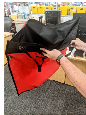
Semi-rigid for easy installation.