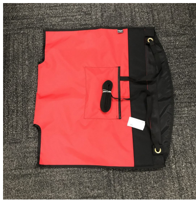
Bell 230 Blade Tie-Downs, (Semi-Rigid) W/Telescoping Attachment Handle