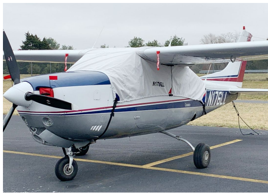
Cessna 210L Over The Top Style Canopy Cover