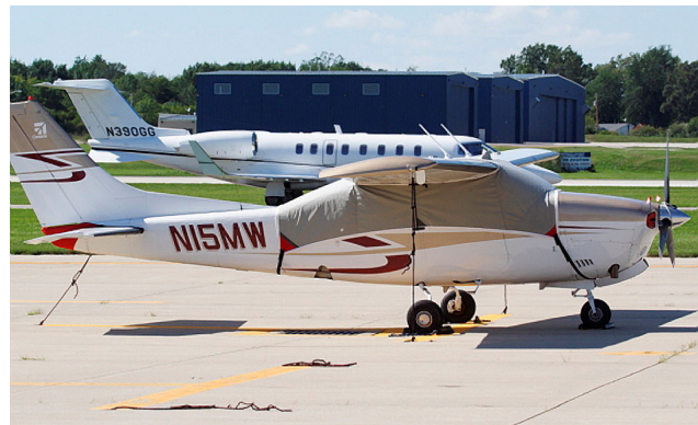
Cessna 210 Canopy Cover, Engine Plugs, Tailcone Cover