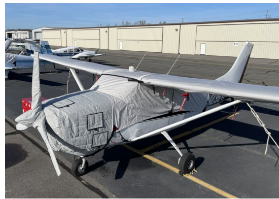
Cessna 210 Winter Cover Set