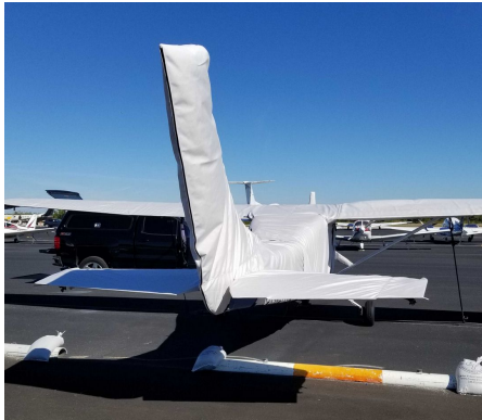
Cessna 210B Empennage Cover

WINTER USE MATERIAL - Made with Solution-Dyed Polyester fabric, this option is intended for seasonal use to aid in deicing, rain mitigation, or for occasional travel. The material is lighter and more compact, but more susceptible to UV damage and may have a shorter useful life if used continuously outside than the all-year use material.