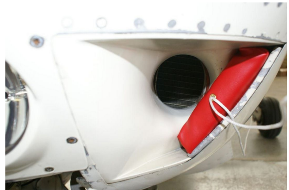
Cessna 210 Engine Inlet Plug