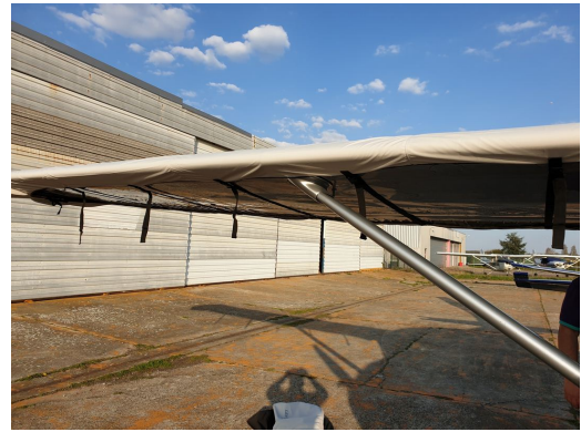
Cessna 207 Wing Covers