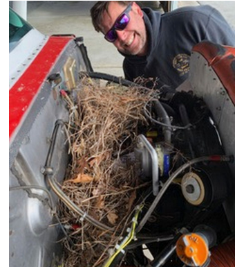
Cessna 172 Bird Nest Problem