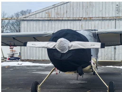
Cessna 190 Travel Canopy, Insulated Engine, Wing & Prop Covers

WINTER USE MATERIAL - Made with Solution-Dyed Polyester fabric, this option is intended for seasonal use to aid in deicing, rain mitigation, or for occasional travel. The material is lighter and more compact, but more susceptible to UV damage and may have a shorter useful life if used continuously outside than the all-year use material.