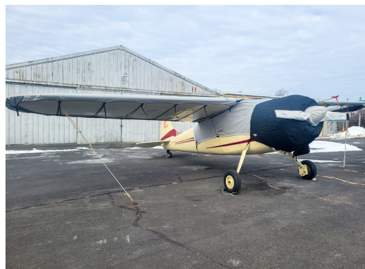
Cessna 190 Travel Canopy, Insulated Engine, Wing & Prop Covers