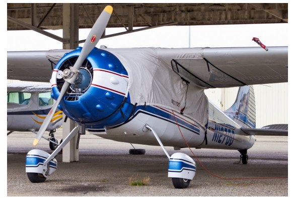
Cessna 195 Over-top Canopy Cover, 24" fwd ext to cover cowl ring gap, gas cap ext. & under belly cowl ring gap mesh covering