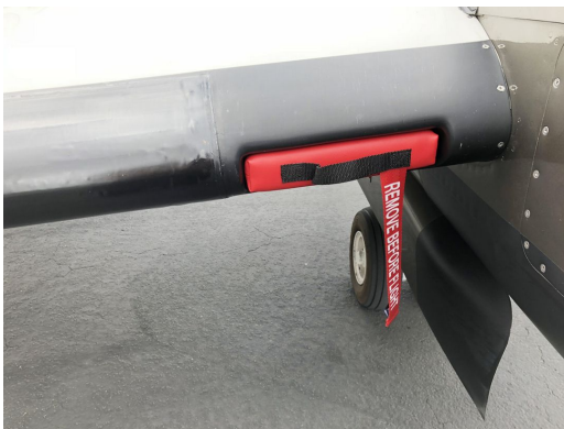
Beech King Air Heat Exchanger Inlet Plug

Engine Inlet Plugs are custom fit for your Beech 1900C intakes, made with heavy-duty vinyl material, and stuffed with a single block of sculpted urethane foam. Each plug has a zipper that allows the foam to be removed and dried if necessary. Engine plugs have warning flags that are visible from the cockpit or 'remove before flight' streamers sewn onto the face of the plugs. Most plugs are imprinted with the aircraft registration number in black for an extra charge. Storage bag NOT included. Engine plugs may be inserted after flight when the engine is still warm. Engine Inlet Plugs are commonly referred to as Cowl Plugs, Intake Plugs, Cowl Blocks, Engine Blocks, and Engine Bungs.