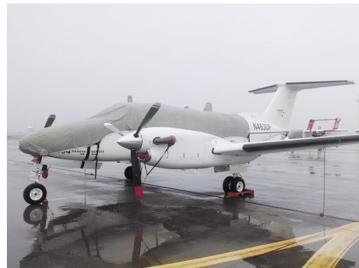
King Air 200 Canopy/Nose Cover, Engine Plugs & Prop Ties