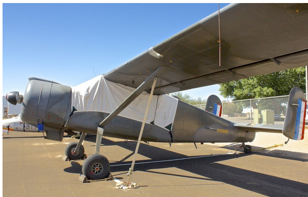
Max Holste 1521 Broussard Canopy Cover