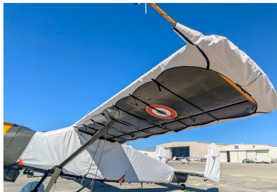
Max Holste 1521 Broussard Complete Cover Set