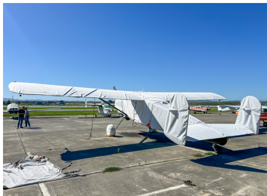
Max Holste 1521 Broussard Complete Cover Set