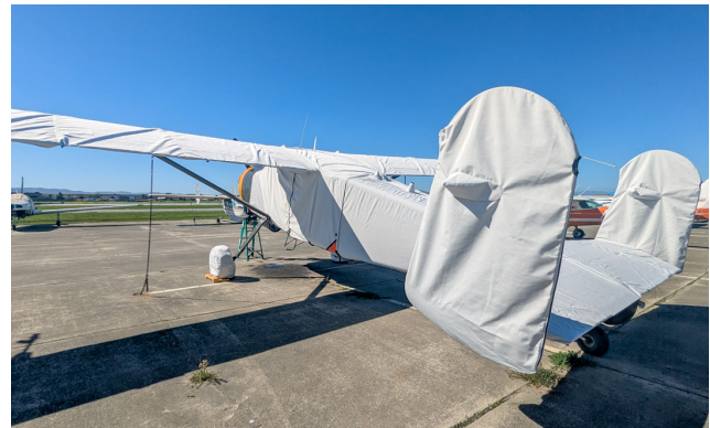
Max Holste 1521 Broussard Complete Cover Set