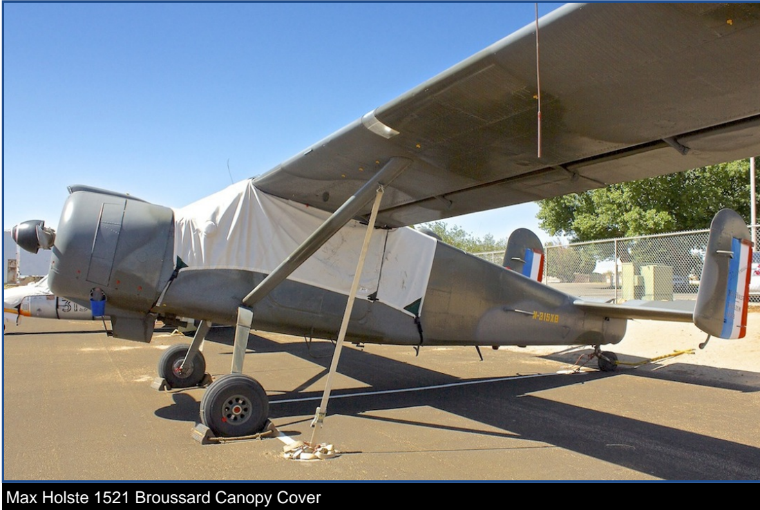
Max Holste 1521 Broussard Canopy Cover