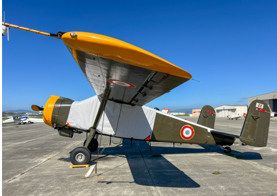
Max Holste 1521 Broussard Extended Canopy Cover

This cover type is made from Silver Acrylic Sunbrella canvas and is 100% lined with a soft and smooth microfiber. Bruce's Custom Covers developed this material combination especially for aircraft protection. The outer material is medium weight and treated for water resistance, UV resistance and anti-static buildup. The inner lining is a very soft and smooth microfiber to prevent scratching. The material is very reflective, and tests show that the cabin interior temperature can be reduced to near-ambient temperature on the hottest of days. It is water, ice and snow repellent, yet breathable to allow moisture to escape from between the cover and the aircraft surface.