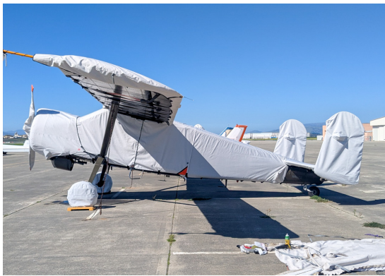
Max Holste 1521 Broussard Complete Cover Set

WINTER USE MATERIAL - Made with Solution-Dyed Polyester fabric, this option is intended for seasonal use to aid in deicing, rain mitigation, or for occasional travel. The material is lighter and more compact, but more susceptible to UV damage and may have a shorter useful life if used continuously outside than the all-year use material.