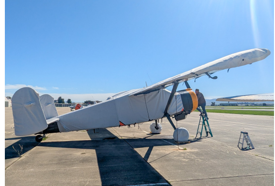
Max Holste 1521 Broussard Complete Cover Set