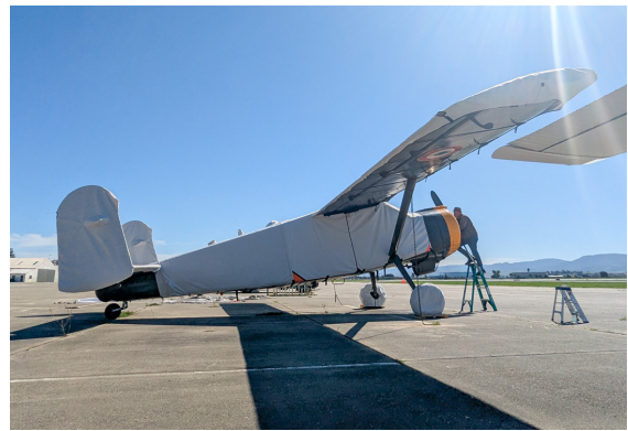
Max Holste 1521 Broussard Complete Cover Set