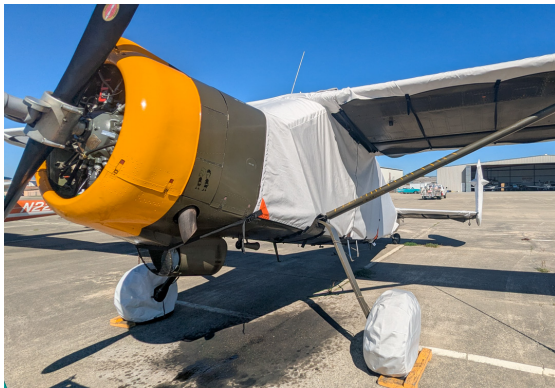
Max Holste 1521 Broussard Complete Cover Set

This cover type is made from Silver Acrylic Sunbrella canvas and is 100% lined with a soft and smooth microfiber. Bruce's Custom Covers developed this material combination especially for aircraft protection. The outer material is medium weight and treated for water resistance, UV resistance and anti-static buildup. The inner lining is a very soft and smooth microfiber to prevent scratching. The material is very reflective, and tests show that the cabin interior temperature can be reduced to near-ambient temperature on the hottest of days. It is water, ice and snow repellent, yet breathable to allow moisture to escape from between the cover and the aircraft surface.