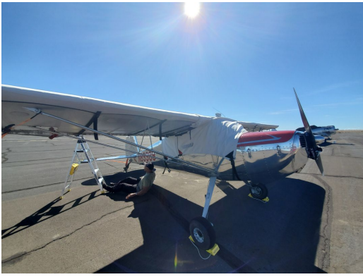
Cessna 140 Over The Top Style Canopy Cover