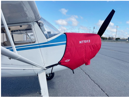
Cessna 140 Insulated Engine Cover

This cover type is made from Silver Acrylic Sunbrella canvas and is 100% lined with a soft and smooth microfiber. Bruce's Custom Covers developed this material combination especially for aircraft protection. The outer material is medium weight and treated for water resistance, UV resistance and anti-static buildup. The inner lining is a very soft and smooth microfiber to prevent scratching. The material is very reflective, and tests show that the cabin interior temperature can be reduced to near-ambient temperature on the hottest of days. It is water, ice and snow repellent, yet breathable to allow moisture to escape from between the cover and the aircraft surface.