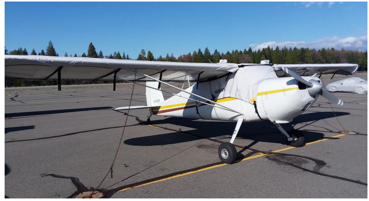
Cessna 140 Canopy and Wing Covers