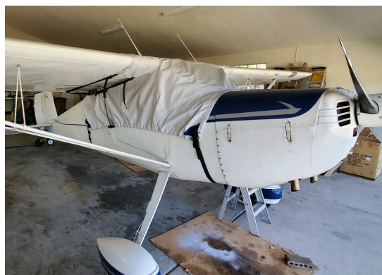
Cessna 140 Canopy Cover, Over Top Type, extends to cover gas caps