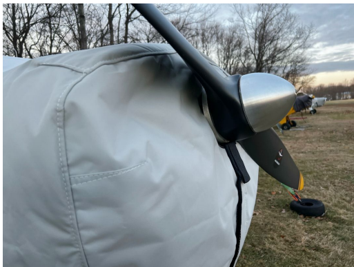
Aeronca Chief 11AC, Super Chief 11CC Insulated Engine Cover

This cover type is made from Silver Acrylic Sunbrella canvas and is 100% lined with a soft and smooth microfiber. Bruce's Custom Covers developed this material combination especially for aircraft protection. The outer material is medium weight and treated for water resistance, UV resistance and anti-static buildup. The inner lining is a very soft and smooth microfiber to prevent scratching. The material is very reflective, and tests show that the cabin interior temperature can be reduced to near-ambient temperature on the hottest of days. It is water, ice and snow repellent, yet breathable to allow moisture to escape from between the cover and the aircraft surface.