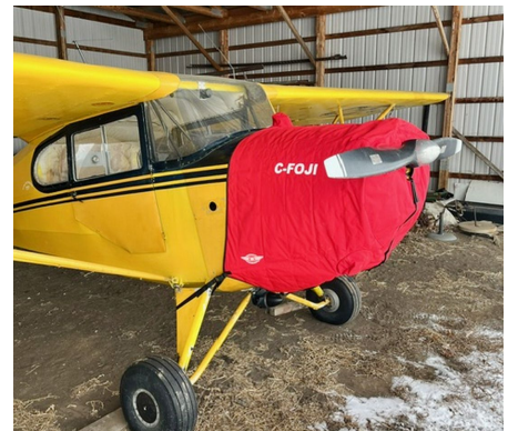
Aeronca 11AC Chief Insulated Engine Cover