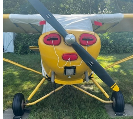
Aeronca 11AC Engine Inlet Plugs